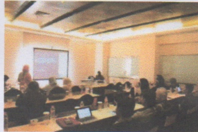
( http://icoemis.teknik.ub.ac.id/wp-content/uploads/2022/03/IMG_7691.jpg )