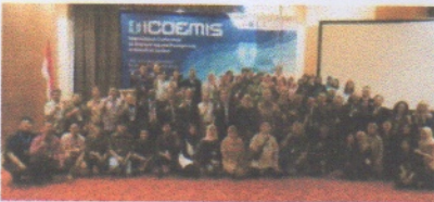
( http://icoemis.teknik.ub.ac.id/wp-content/uploads/2022/03/DSC01904.jpg )