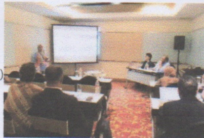
( http://icoemis.teknik.ub.ac.id/wp-content/uploads/2022/03/IMG_7684.jpg )